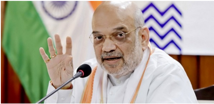
Amit Shah @AmitShah

समस्त देशवासियों को हिंदी दिवस की हार्दिक शुभकामनाएँ।