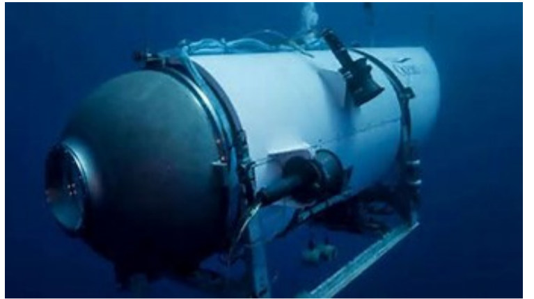
Image of Titan submersible, chilling 3-word message before implosion revealed

of anti-Hindu violence across 52 of the 64 districts. Following the resignation of the Sheikh Hasina government, these attacks have intensified, especially in rural areas where Hindus live in constant fear," the outfit said. India is set to host two Test matches and three T20Is against Bangladesh from September 19 to October 12, across venues in Chennai, Kanpur, Gwalior, Delhi, and Hyderabad.