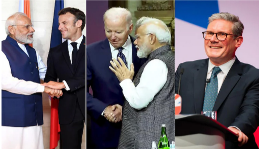
permanent member of the UNSC. "As long as we have a Security Council that is blocked, I would say, reciprocally according to the interests of each party, we will have difficulty moving forward. So let's just make these United Nations more effective, first by perhaps making them more representative. That is why France, and I repeat here, is in favor of the Security Council being expanded," he told the UN General Assembly. "Germany, Japan, India, and Brazil should be permanent members, as well as two countries that Africa will decide to represent it," he added. Last week, Joe Biden had also vouched for India as a permanent member of the UNSC. During his talks with Prime Minister

New York : UK Prime Minister Keir Starmer backed India's bid for a permanent membership of the United Nations Security Council (UNSC), days after US President Joe Biden and France's Emmanuel Macron made a similar pitch. Addressing the general debate of the United Nations General Assembly's seventy-ninth session in New York, Mr Starmer said the UNSC has to change to become a "more representative body". At present, the UNSC comprises five permanent members and 10 non-permanent member countries which are elected for a two-year term by the General Assembly of the United Nations. The five permanent members are Russia, the UK, China, France, and the United States, which have the power to veto any substantive resolution. "We want to see permanent African representation on the Council, Brazil, India, Japan, and Germany as permanent members, and more seats for elected members as well," Mr Starmer said. Earlier, French President Emmanuel Macron had also voiced strong support for India's inclusion as a