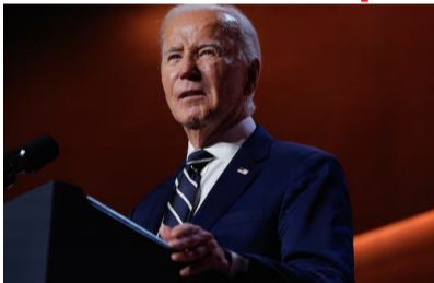
also added to aid with the presidential transition. The measure easily passed Congress on a bipartisan basis, 341-82 in the House and 78-18 in the Senate, with Republicans supplying all the no votes in both chambers.

Washington : President Joe Biden signed a temporary government spending bill that keeps agencies operating into December, after Congress punted key spending decisions until after the November election. The bill generally funds agencies at current levels through December 20, setting up the prospect of a government shutdown fight just before the holiday season. Lawmakers did agree to add $231 million to bolster the Secret Service after the two assassination attempts against Republican presidential nominee Donald Trump. Money was